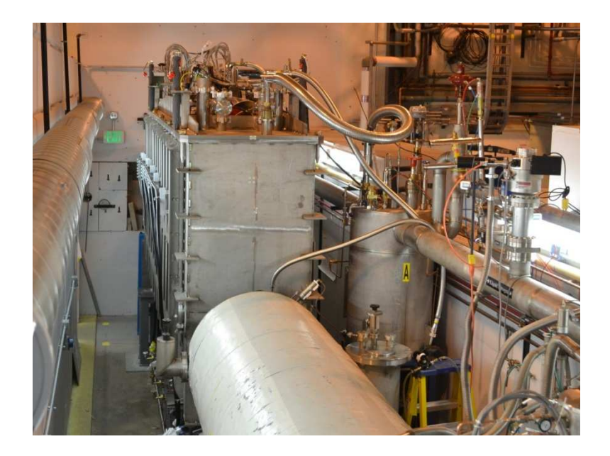
Figure 2: The reconfigured ATLAS Booster area with the new cryomodule (rectangular structure) coupled to a cryomodule of the previous generation (white, circular structure).